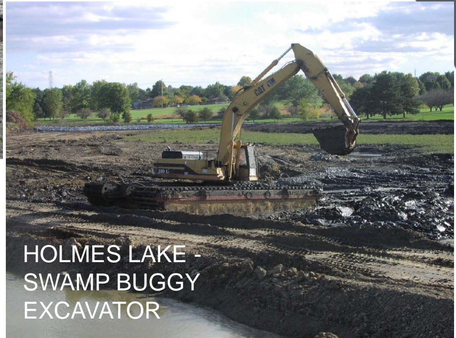
HOLMES LAKE - SWAMP BUGGY EXCAVATOR