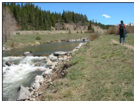
Restored Section of Blue River Through Former Mining Area