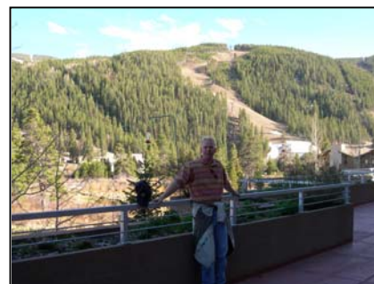
Keystone Ski Slopes in Background

I chose a variety of sessions to attend rather than sticking to just one track as I did last year when I was certified in watershed assessment by the Center for Watershed Protection. I attended the following sessions: SATURDAY - Creating Less Stupid Growth, Hybrid & Quasi-Governmental Watershed Groups, and Grant-writing for the Small Shop; SUNDAY - Funders Forum Panel, Field Trip to see several restoration projects on the Blue River; MONDAY - How to Ask for a Major Gift and Preventing the Impacts of New Development. I departed 5:15 a.m. on Tuesday. Although the area was so beautiful, I was happy to return to a lower altitude since Keystone is at 9,000 feet above sea level. Several speakers and many participants were literally breathless from the thinner air. After a few days, I was finally getting used to it and then it was time to return.