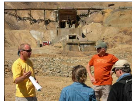
Discussing Water Clean-up at Former Wellington Mine - Site of largest gold nugget found in US