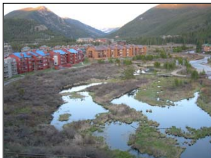
Keystone Resort - My view every morning

River Rally 2005 I recently attended the 2005 River Network's River Rally in Keystone Colorado from May 20 - 24, 2005. Yes, what an awful location for a conference with the backdrop of snowcapped mountains, fresh mountain air, beautiful streams, abundant wildlife, and 70 degree weather. This is the second time I have attended this rally and again it was full of interesting presentations, fundraising seminars, topical issues (some controversial), camaraderie, and a genuine opportunity for me as a river manager to mingle and exchange ideas and stories with others in my field. On Sunday of the conference, we had the opportunity to take a field trip and see firsthand some watershed restoration projects.