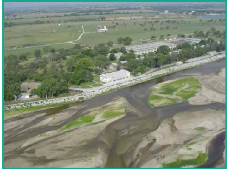
The Historic Building 50 at Camp Ashland

After this flood event, the river reach upstream of Highway 6 in Sarpy and Saunders County was identified for a levee rehabilitation project by the Corps of Engineers. The project was authorized by Congress in the Water Resources Development Act of 2000. The Papio-Missouri River NRD and two adjoining NRDs on the west side of the Platte River (the Lower Platte North and Lower Platte South NRDs) are the local sponsors for the $42 million project. The sponsors with financial assistance from