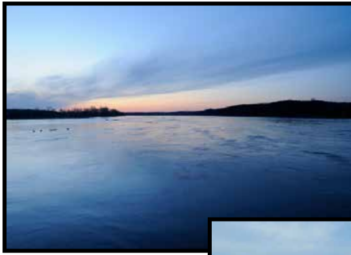
A CAMERA ON THE LIED PLATTE RIVER BRIDGE NEAR SOUTH BEND HAS CAPTURED HIGH FLOWS IN 2011, DROUGHT IN 2012, ICE FORMATION, AND WILDLIFE ON THE LOWER PLATTE RIVER.

Visit www.plattebasintimelapse.com to learn more and stayed tuned for continued developments.