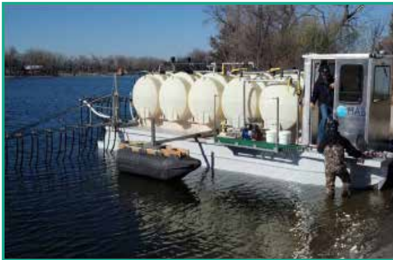
PICTURED ABOVE AND BELOW SPECIALLY EQUIPPED WATER CRAFT ADMINISTER THE ALUM TREATMENT

which binds to phosphorus. The alum stripped the water column of any phosphorus and continues to bind and retain phosphorus as it is released from the bottom of the lake until all binding sites of the floc are full. Previous alum treatments at Fremont SRA have proven to be successful in reducing phosphorus concentrations and as a consequence reducing algal growth.