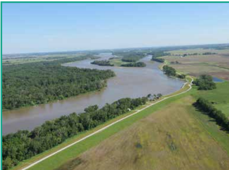
Confluence of Platte and Elkhorn Rivers

Perhaps the most significant benefit of the Western Sarpy/Clear Creek Flood Reduction Project is the security of Omaha and Lincoln well fields, supplying water to nearly 50% of Nebraska's population. Three NRDs, the Papio-Missouri River, Lower Platte South and Lower Platte North, have been working diligently with the US Army Corps of Engineers, the State of Nebraska, other government agencies and the Congressional delegation for over 13 years to see this project through to completion.