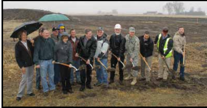
Schuyler officials, Lower Platte North NRD members, USACE, and TJC Engineering break ground on the Schuyler flood risk management project.

Once Phase 1 is completed in the fall of this year and funding has been secured Phase 2 of the project will involve the construction of a new 2.5-mile levee south and west of Schuyler along Lost Creek. Currently the Omaha District is working on the final design of the Platte River levee. Once the total project is fully implemented (Phase 1 and 2) the majority of Schuyler will be protected from the 100-year flood, and annual flood damages will be reduced by approximately $1.9 million.